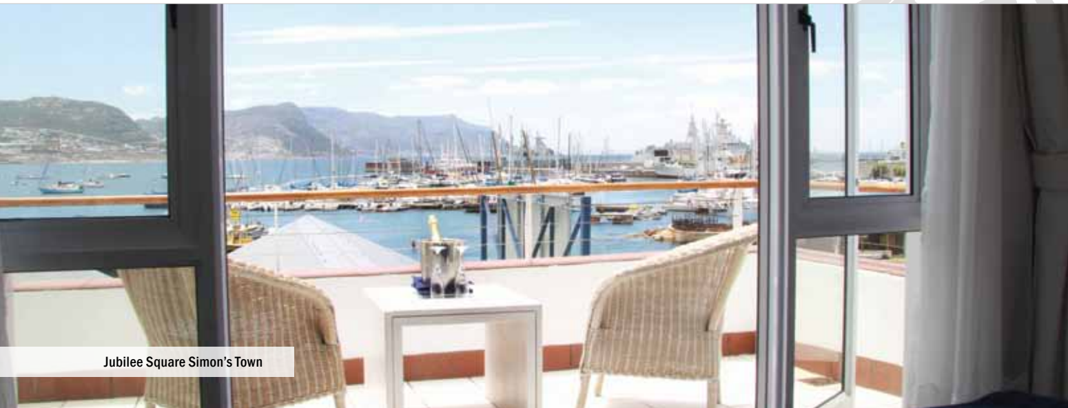
Jubilee Square Simon's Town